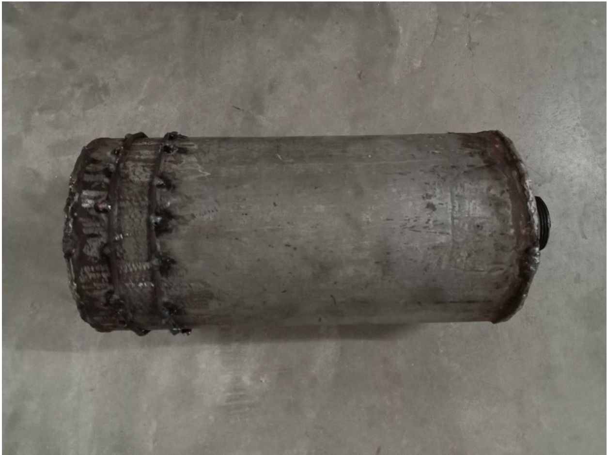
Figure 3.4.1.2: Reactor

The production of oil from waste plastics typically involves a process called pyrolysis. Pyrolysis is a thermal decomposition process that breaks down organic materials, such as plastic, into smaller molecules in the absence of oxygen. Here's a general overview of how a pyrolysis reactor can be used for oil production from waste plastics: