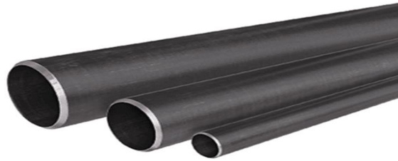
Figure 3.4.1.6: M.S Pipe

An M.S. pipe, also known as a Mild Steel pipe, refers to a type of pipe made from low-carbon steel. M.S. pipes are widely used in various applications due to their durability, strength, and affordability. Here are a few key characteristics and applications of M.S. pipes: