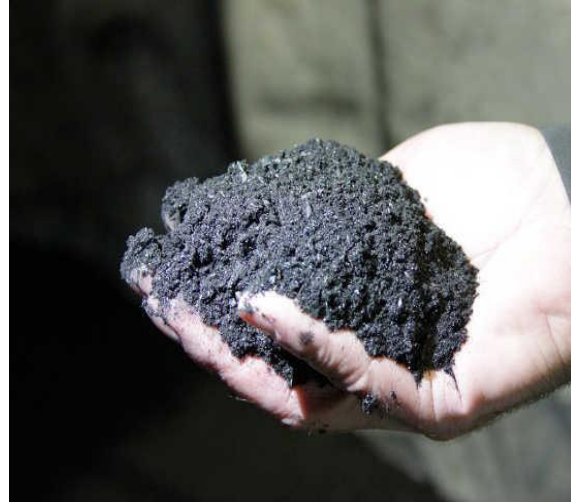
Figure4.2.1: Oil and Char as an output of the equipment

Conversion efficiency is the ability of the equipment to convert waste plastic into oil in terms of weight. This is computed by dividing the weight of oil recovered by the original weight of plastic and is multiplied by 100. Based on the result of the study, the waste plastic oil converter has a 61.8% conversion efficiency.