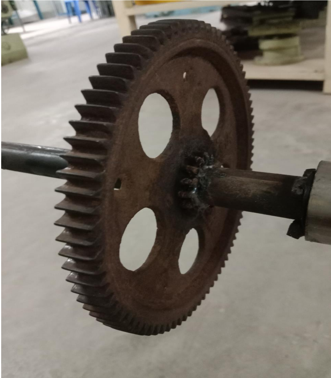
Figure 3.4.1.5: Gear

Gear is often used to describe a toothed wheel or cylinder that interacts with other gears to transmit or alter motion in machinery. Gears are commonly found in engines, vehicles, and various mechanical systems. They are used to transfer power, change rotational speed or direction, and provide mechanical advantage.