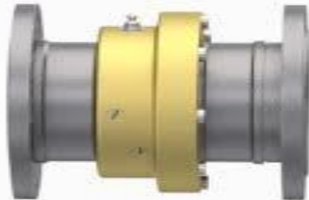
Figure 3.4.1.4: Rotary Joint

Rotary joints are commonly used in a wide range of applications where there is a need for the transfer of media (such as fluids, gases, or compressed air) between stationary and rotating parts.