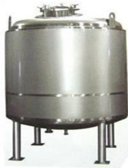
Figure.3.4.1.3: Storage tank

After the production of oil from waste plastics through pyrolysis, the resulting oil is typically stored in storage tanks. These tanks are designed to safely store and preserve the oil until it is further processed or utilized. Here are some key points regarding the storage of oil from waste plastics: