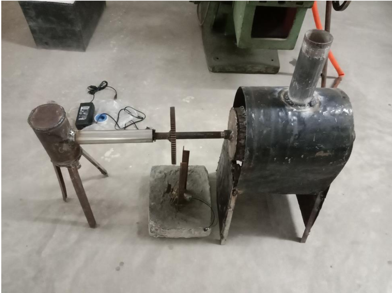
Figure3.2.1: Final Project

Diesel 80%-90% will be the final product, since waste tire, plastic oil is a special oil. It is different from underground mining. When waste engine oil is employed in refining, the item is 95%-100%. This is a standard diesel which can be employed in a application as an example in diesel engines.