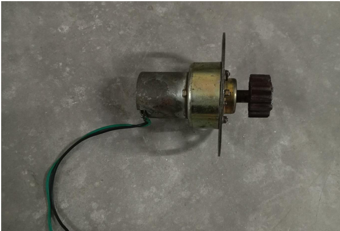
Figure 3.4.1.5: D.C Gear Motor

A gear motor is an all-in-one combination of a motor and gearbox. The addition of a gear head to a motor reduces the speed while increasing the torque output. ... Most of our DC motors can be complimented with one of our unique gearheads, providing you with a highly efficient gear motor solution. A DC motor is any of a class of rotary electrical machines that converts direct current electrical energy into mechanical energy. The most common types rely on the forces produced by magnetic fields. Nearly all types of DC motors have some internal mechanism, either electromechanical or electronic, to periodically change the direction of current flow in part of the motor.